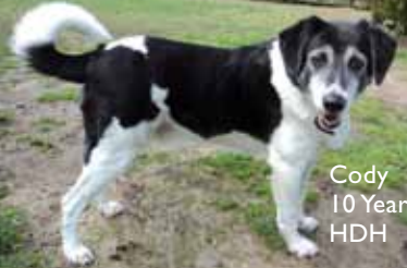
Cody 10 Years HDH